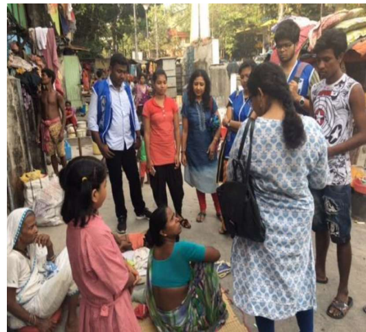
Camp on Drainage System, Sanitation & Public Health